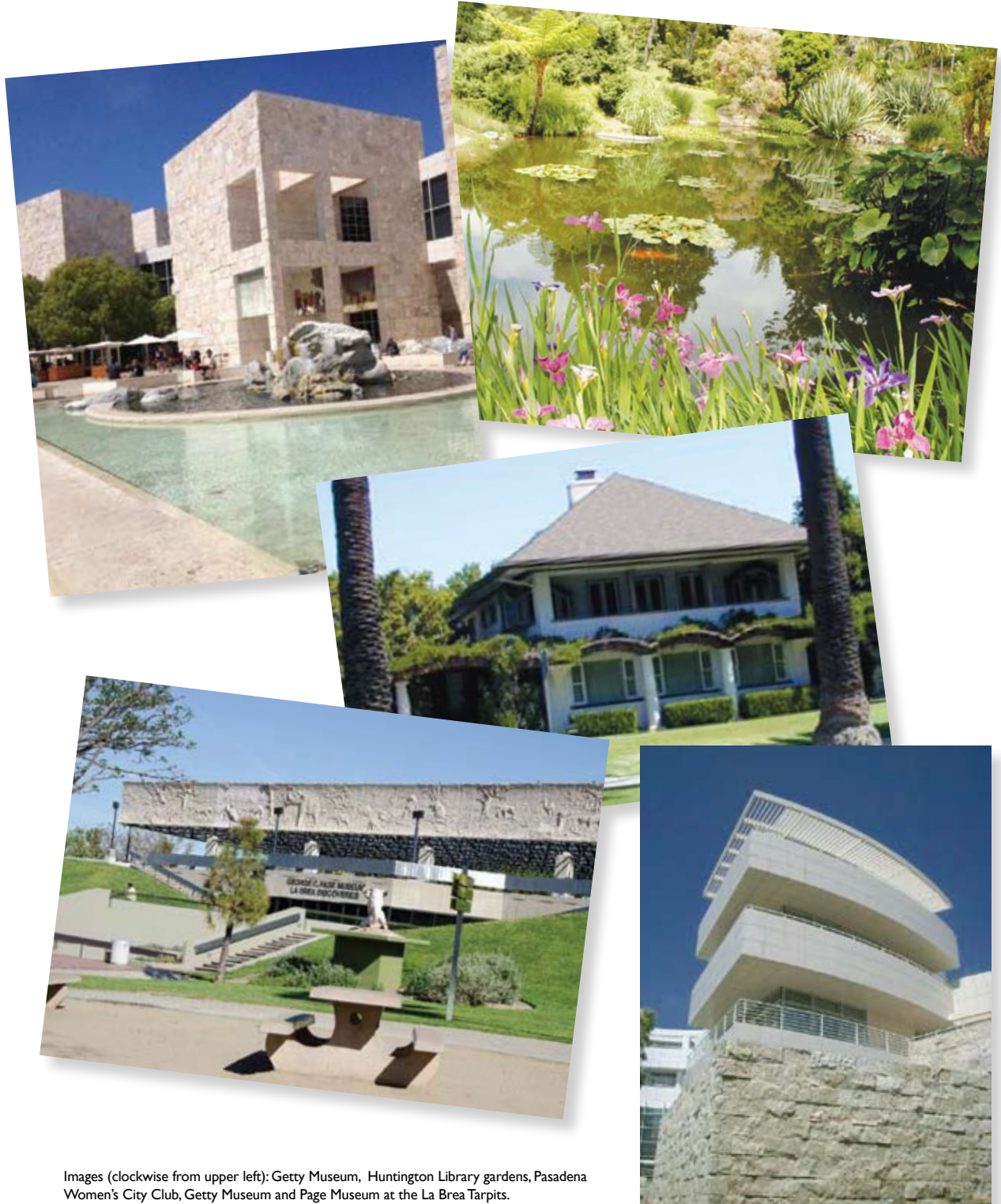
Images (clockwise from upper left): Getty Museum, Huntington Library gardens, Pasadena Women's City Club, Getty Museum and Page Museum at the La Brea Tarpits.

53rd Annual Meeting • September 27-30, 2012 • Pasadena, California