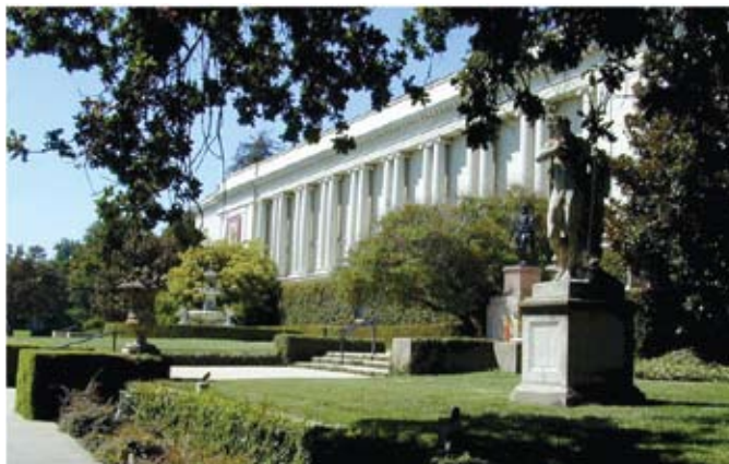
Huntington Library in Pasadena, California